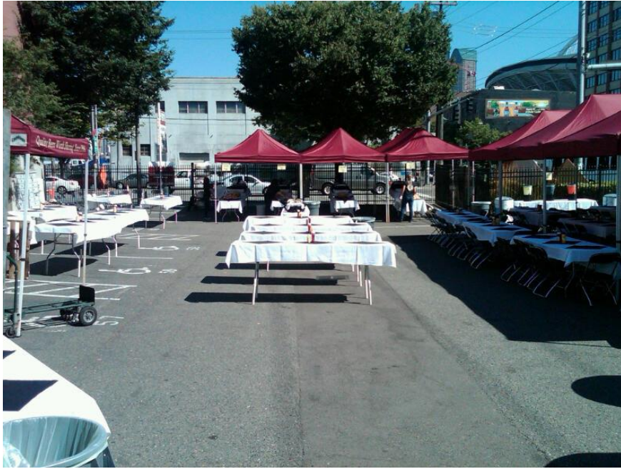
Set up for parties of 200-400 people